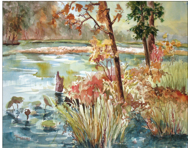
"Lake Liles"

After dinner Sunday night we will be "settling in" to the studio and our rooms. We usually paint out on location in the mornings and back in the studio in the afternoons. Class meets Monday through Friday from 9:00 to 4:30 with a 1 1/2 hour break for a leisurely lunch. Thursday afternoon will be free time. You could have a massage, shop, explore the town, or go to a matinee show. That night we meet at 8:00 PM for a "fast process" demo.