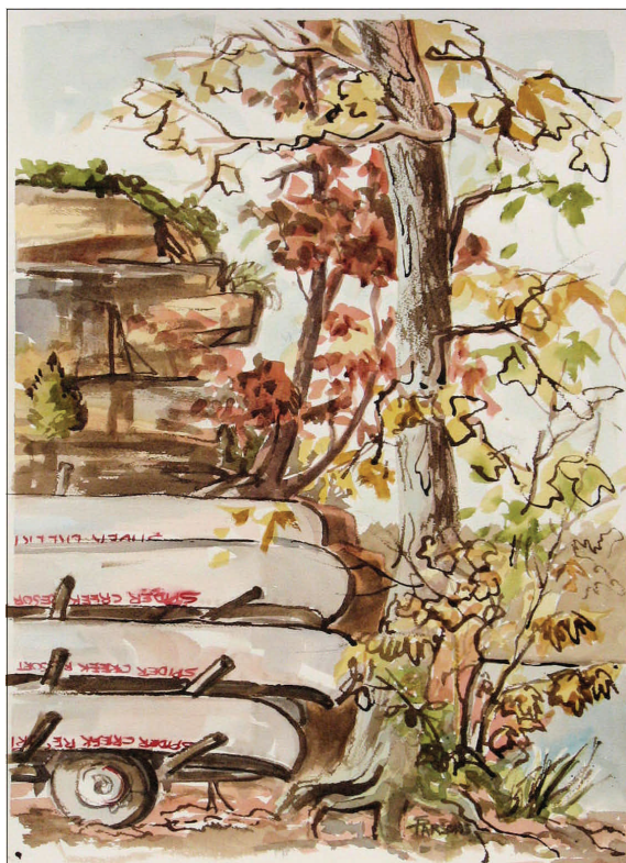
“Spider Creek Canoes”